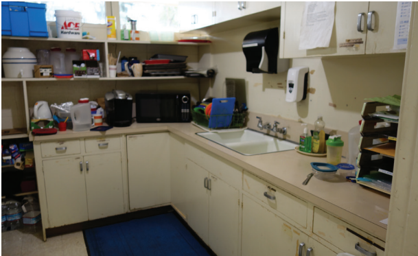
Staff Work Room / Lounge