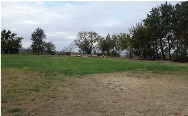
Playfields / Athletics