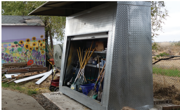
Exterior Garden Storage