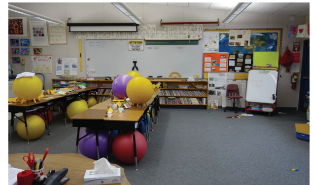
Kindergarten / Child Care Classroom