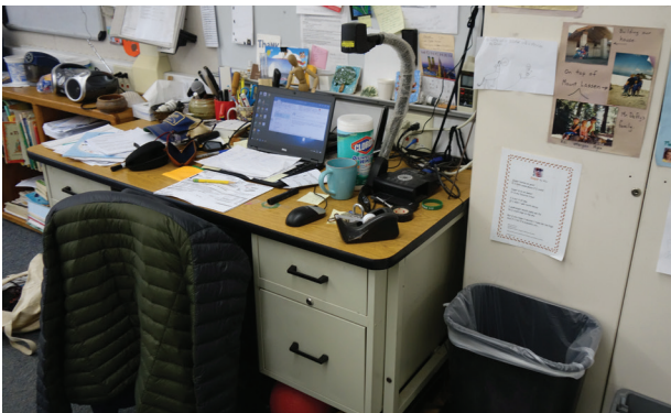
Teaching Station / Presentation Technology